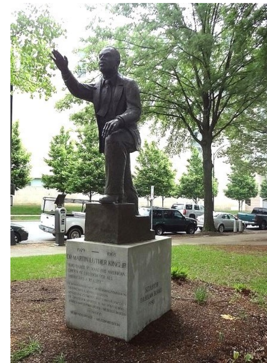
MLK, JR STATUE – 1980

For more information, contact the Heinz History Center