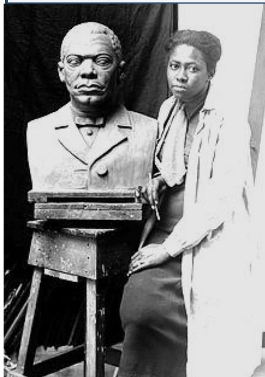
Bust of Booker T. Washington by Selma H. Burke Circa 1935

I f you lived in Pittsburgh between 1968 and 1981, you may already know that Pittsburgh was the home of the Selma Burke Art Center, which was located in East Liberty. Selma Burke was a well known artist during that time. She was born in 1900 in Mooresville, North Carolina as the seventh of 10 children. Selma was passionate about art from an early age. In 1945, she recounted her discovery of sculpting to a reporter from the New York Post “She began sculpting small objects and animals with white clay from a nearby riverbed. “One day, I was mixing the clay and I saw the imprint of my hands,” ... “I found that I could make something... something that I alone had created.” Selma’s father encouraged her pursuit of art; however, her mother, being more realistic encouraged her daughter to go to nursing school so that she would be able to provide for herself. Selma was obedient and went to Saint Agnes Training School for Nurses in Raleigh, North Carolina, where she graduated as a registered nurse in 1924. She moved to Philadelphia where she practiced nursing for several years; but, her love of sculpting never waned. In 1935, she moved to New York and worked