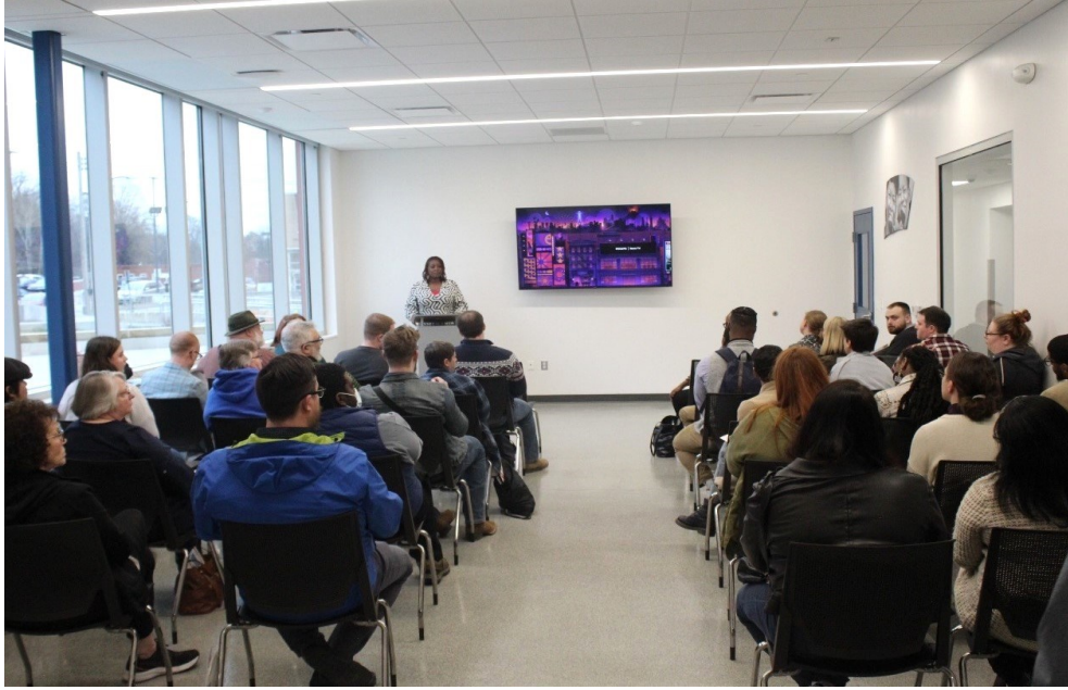
The students and professors were given a tour of the facility .

On Thursday, March 7, 2024, ACH participated in the Hybrid Gathering Contextual Engagement Program held by the Pittsburgh Theological Seminary. They were visiting local non-profit organizations located in the Hill District to provide opportunities to its students to provide insight into how Christian witness and ministry, as well as civic leadership and community service unfold.